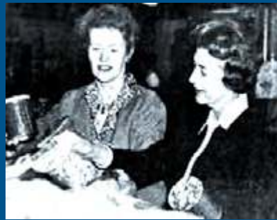
The Ann Arbor Thrift Shop has given more than $1.5 million to the Ann Arbor community in the past five years.

“Beginning with the 2022 grant cycle, we were pleased to redefine “community” as all of Washtenaw County, ensuring that more people can benefit from our support.”