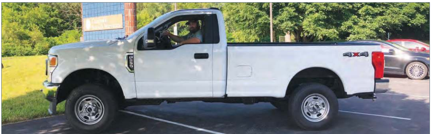
Our New Ford F-250 CSSW Packard Building